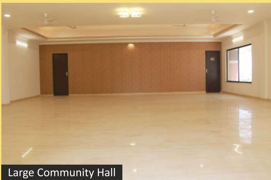
Large Community Hall