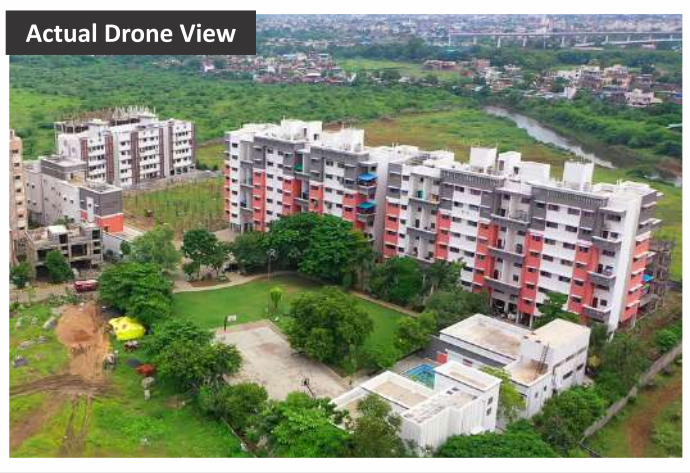
Actual Drone View