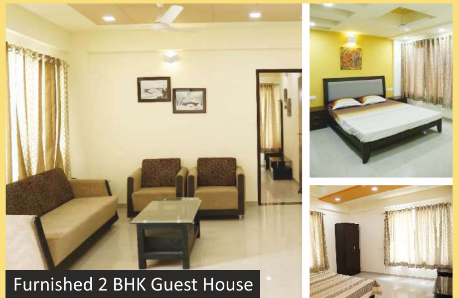
Furnished 2 BHK Guest House